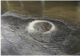
Report Sanitary Sewer Overflows