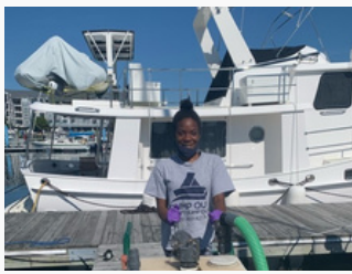
Use our FREE Boater Pump Out program