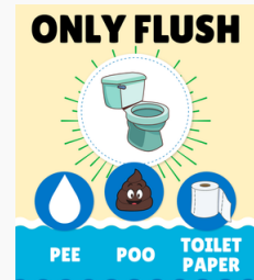
What NOT to Flush