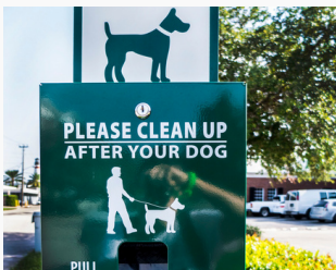
Pick Up Animal Waste