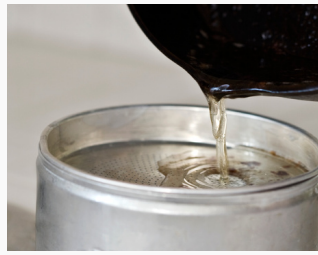
Capture Kitchen Grease in a Can