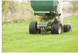
Limit Fertilizer and Lawn Chemical Applications