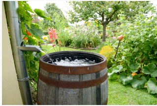
Reduce Stormwater Runoff